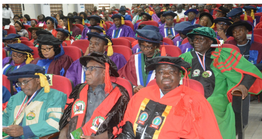
A cross section of Senate Members