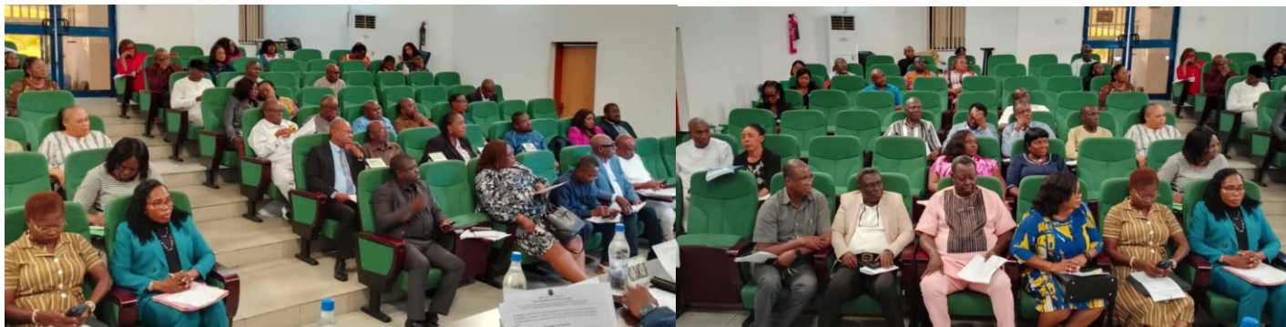
A cross section of Deans and Directors, Provost CMS and HOCs at the Quality Review Cycle